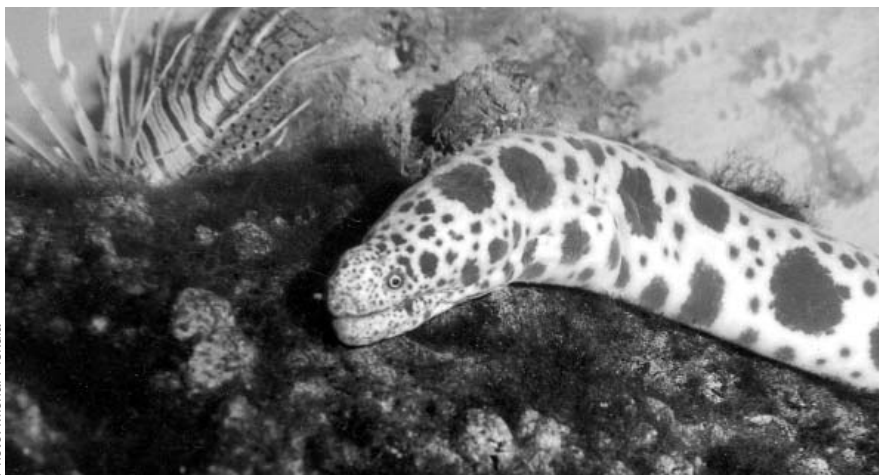
Tiger Moray Eel ( Uropterygius tigrinus )