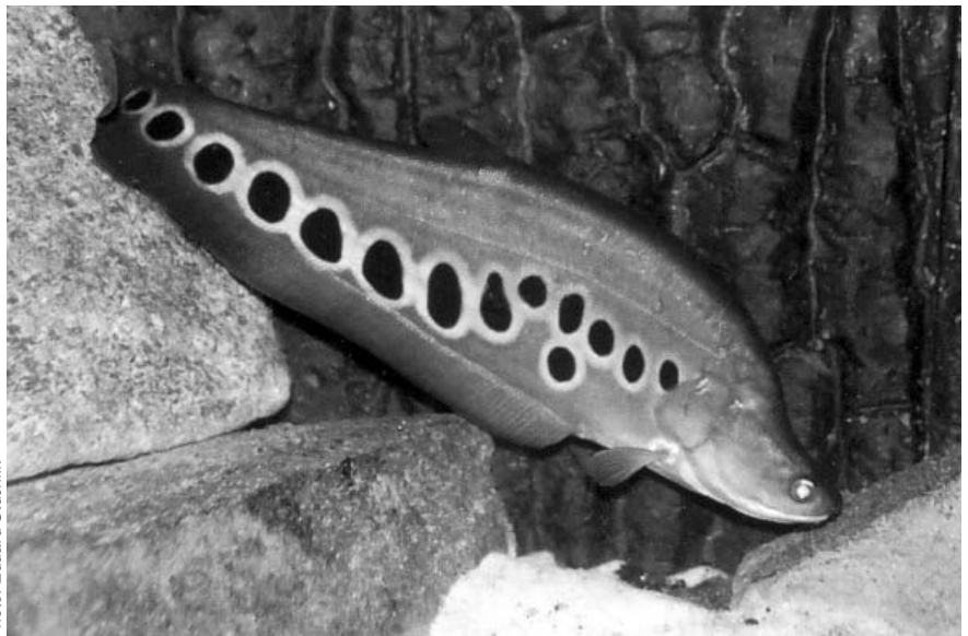
Clown Knifefish ( Chitala chitala )