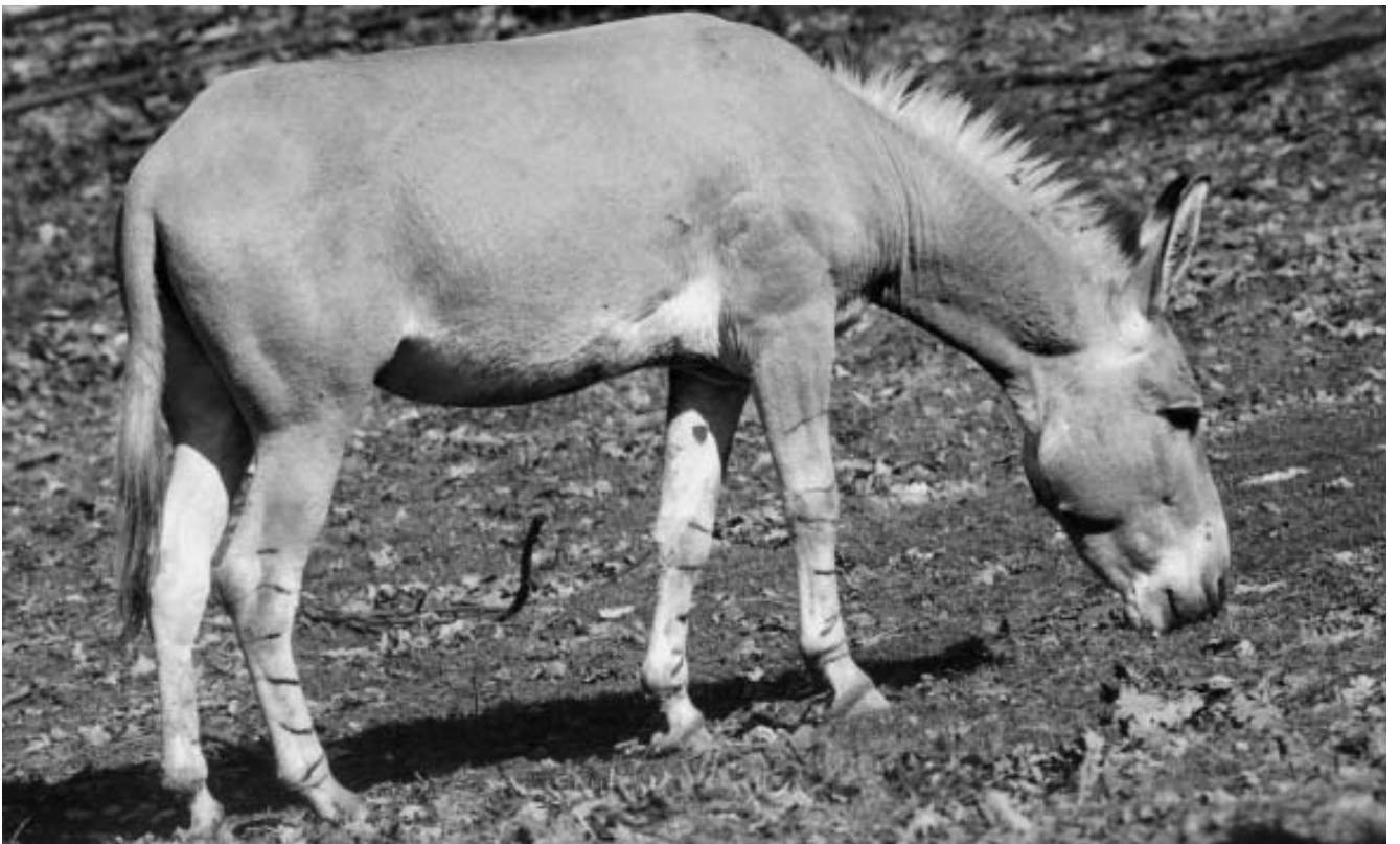
Somali Wild Ass